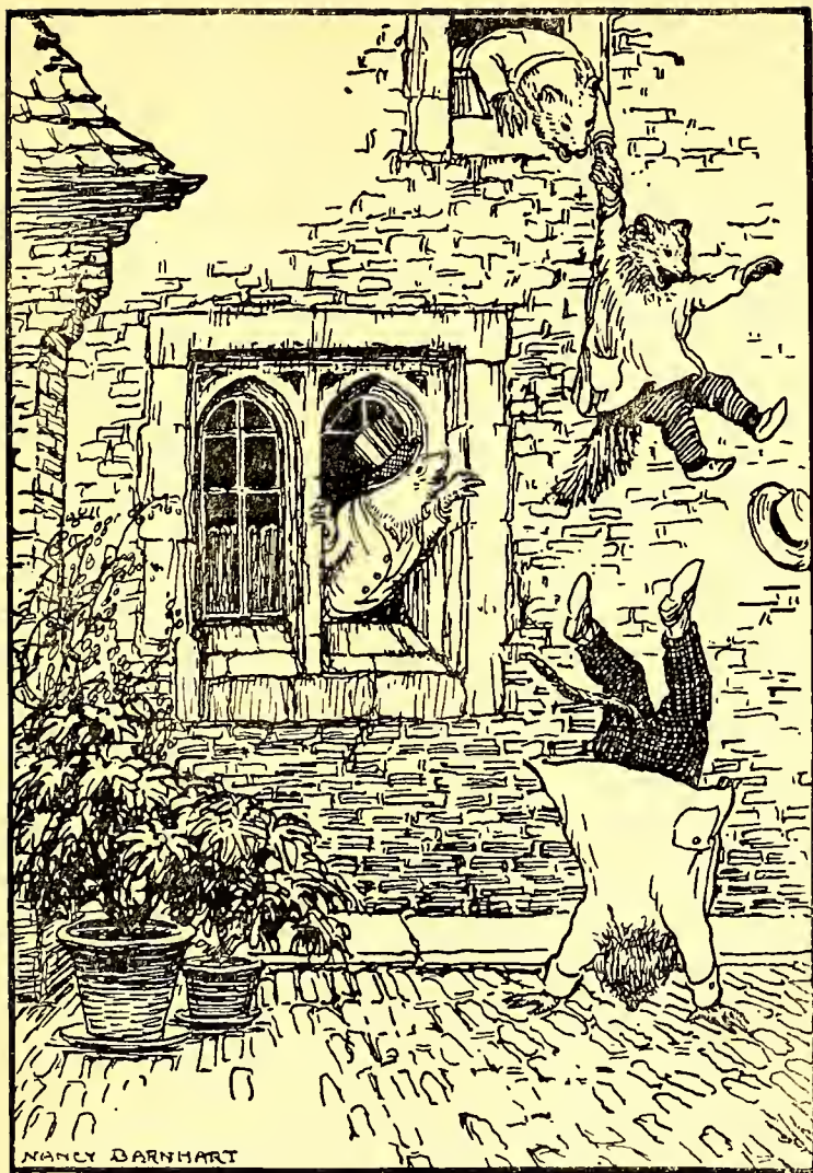
THE WILD WOODERS HAVE BEEN LIVING IN TOAD HALL